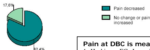
Treatment results: Pain (outcome pain 6 wks)

The validated objective methods and specially designed devices used by DBC to help back pain patients are also one of the main reasons DBC is achieving such results.