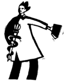
The Medical Doctor